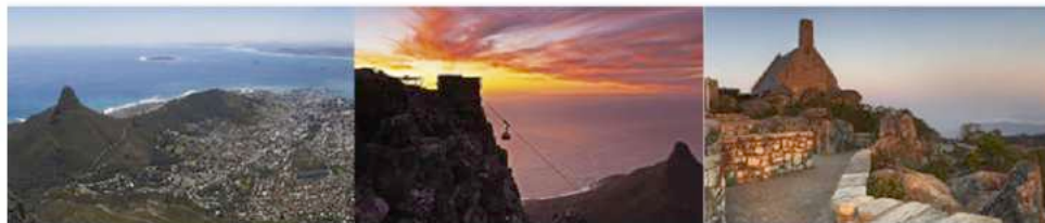
Table Mountain Cableway

Drop off at Table Mountain for your opportunity to travel up the cable car to the most famous Cape Town attraction, with some time to explore at the top of the mountain.