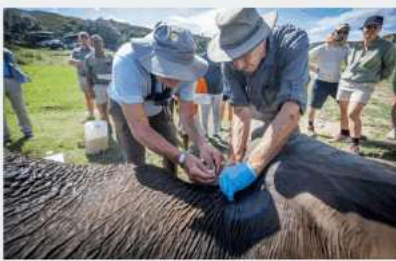
EXPERIENCE THE THRILLING WORLD OF VET SAFARIS AT BOTLIERSKOP PRIVATE GAME RESERVE & VILLAS