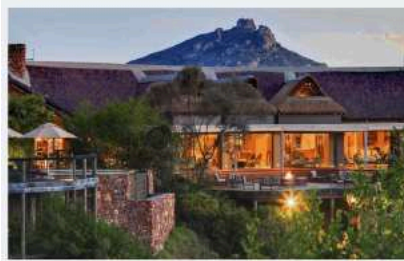
LUXURY IN NATURE: WHAT TO EXPECT FROM A STAY AT BOTLIERSKOP'S TENTED LODGE