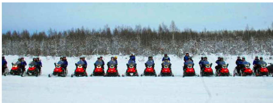
Our past AFS group