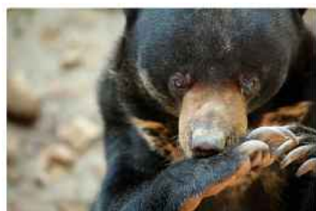
Bornean Sun Bear (, Format: JPEG)

lodge run by tour operator "River Junkies" who hire local villages to give back to the communities. www.hornbill-lodge.com