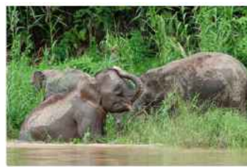
Borneo Pygmy Elephant, Sukau