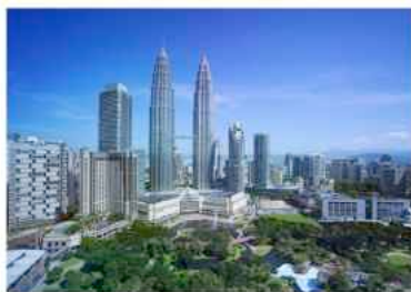
Panoramic View from Traders Hotel Kuala Lumpur

Traders Hotel in Kuala Lumpur is a wonderful place to stay because of its prime location in the heart of the city, offering breathtaking views of the iconic Petronas Twin Towers. The hotel provides luxurious accommodations with modern amenities, ensuring a comfortable and relaxing experience for guests. It is well-known for its exceptional service, with staff going above and beyond to meet the needs of every traveler. Additionally, the rooftop SkyBar is a popular spot to unwind, offering a stunning panorama of the city's skyline.